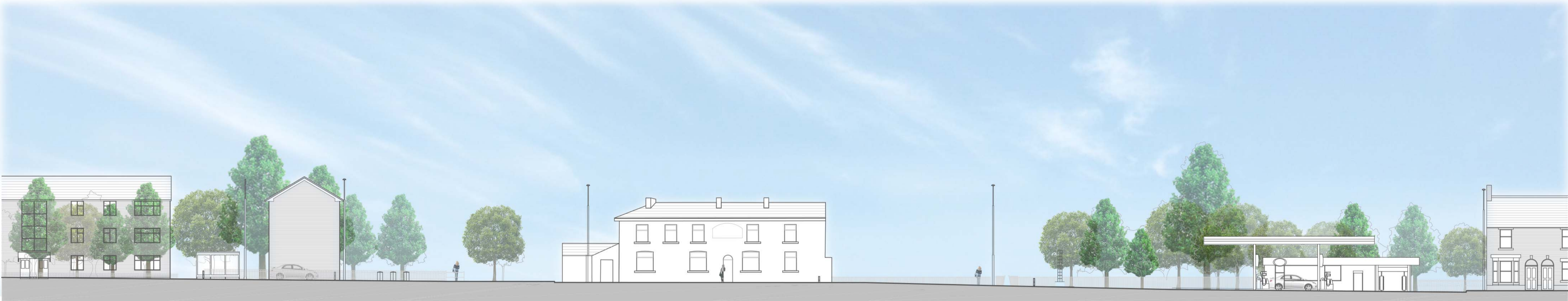
Existing Ashton & Droylsden Road Street Scene 1:200