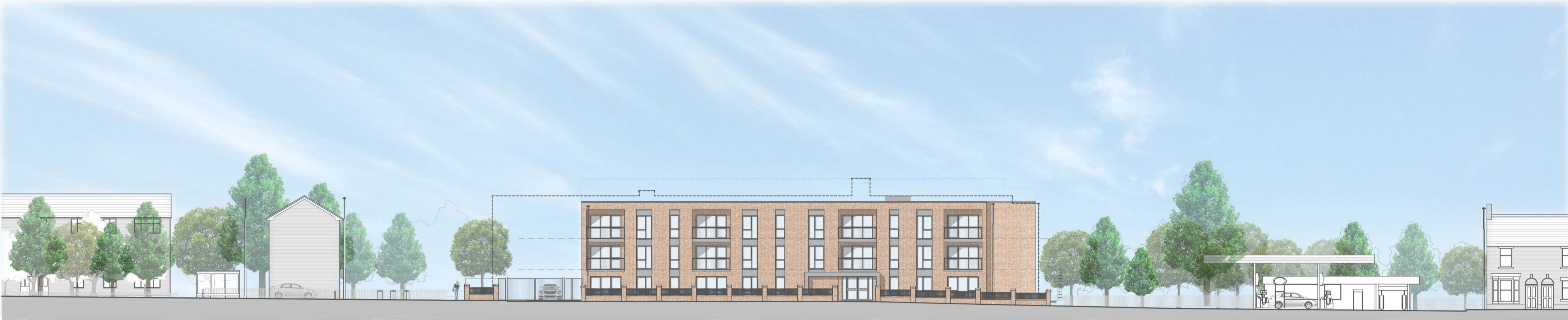
Proposed Ashton & Droylsden Road Street Scene 1:200